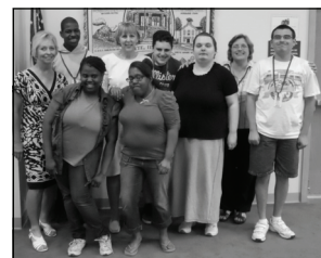
The 2010-11 Coffee Connection students.