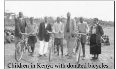
Children in Kenya with donated bicycles.