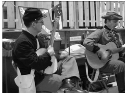
The Battlefield Balladeers

The library's popular annual Fall Family Fun Fest returns again this year with as much fun as ever. Take a hayrack ride, play games with the kids or buy s'mores kits from the Friends and roast your marshmallows over a bonfire. Almost everything is free—and LOTS of FUN!