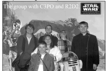
The group with C3PO and R2D2

Thanks to the Friends of the Library for sponsoring our trip to the Museum!