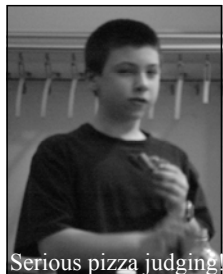
Serious pizza judging!