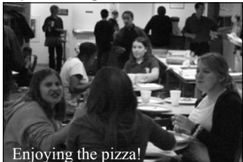
Enjoying the pizza!

YA Pizza Tasting: Thanks to Aurelio's, HiFi's, Main Street, Sam's and Sicilian Joe's for sponsoring this event!