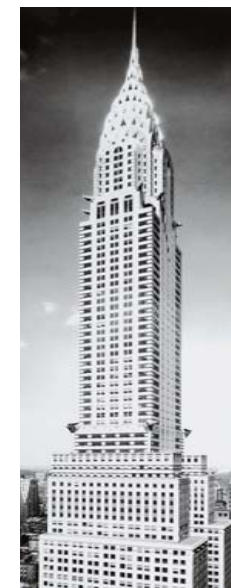
The Chrysler Building, 1926-1930 William Van Alen

Picturing America is an innovative program that helps teach American history and provides students with a gateway to the entire universe of the humanities. It begins with carefully selected masterpieces spanning several centuries. The featured artists range from early American Indian artisans to painters Mary Cassatt and Thomas Hart Benton, from photographers Walker Evans and Dorothea Lange to architects Frank Lloyd Wright and William Van Alen. In partnership with the American Library Association, the NEH has distributed large, high-quality reproductions of these works to schools and libraries nationwide, along with materials and lesson plans for use by educators. These materials unlock the potential of the works of art, enhancing the study of American history, social studies, language arts, literature, and civics.