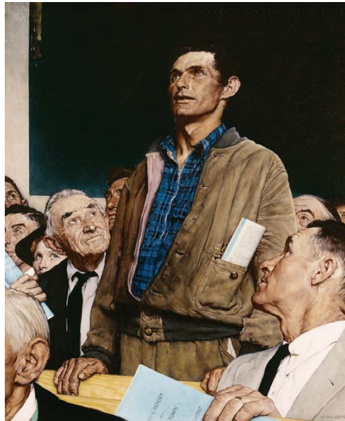
Freedom of Speech (Saturday Evening Post 1943) , 1943, Norman Rockwell

Picturing America provides creative ways to explore our nation's history and ideals. How better to appreciate the power of American democracy than through Norman Rockwell's Freedom of Speech ? Each of the works featured in Picturing America may be explored individually. Yet the collection also lends itself to the study of images in endless combinations that reveal enduring American themes. Taken as a whole, the Picturing America collection offers a powerful depiction of many aspects of American history and culture. These masterpieces enable viewers to transcend the present and witness the dramatic unfolding of our history.