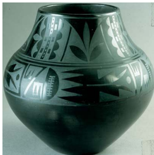
Early American Pottery

By bringing iconic American art into public and private schools, libraries, and communities, Picturing America offers Americans the opportunity to learn about our nation's history and culture in a fresh and engaging way. Picturing America uses art as a catalyst for the study of American history—the cultural, political, and historical threads woven into our nation's fabric over time. The images selected for Picturing America are just a small sample of significant works from the whole body of American art. The goal is to give Americans a deeper appreciation for our country's history by introducing them to its great art. Ultimately, the National Endowment for the Humanities hopes that Picturing America will help prepare and inspire today's Americans as they add their own chapters to our nation's ongoing story.